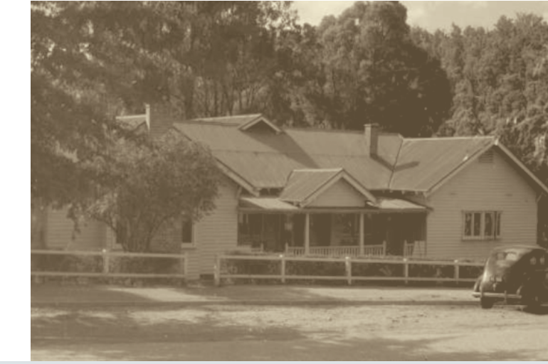
Cumberland Guest House, c. 1940-60

The Cumberland Resort, which once stood on this site, is linked to two of Marysville's most prominent families—the Bartons and the Cuzens.