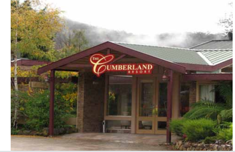
The Cumberland, 2008 [Credit line to be determined]

A guesthouse called the Bungalow was built on this land for Emily Ada Barton in around 1917. Emily had been a guesthouse proprietress since at least 1915, when she managed the short-lived 'Chestnuts'. She was certainly well qualified for the job, having raised, cooked and cleaned for a grand total of 16 Barton children! Emily managed the Bungalow until she sold it to WC Walker in September 1923.