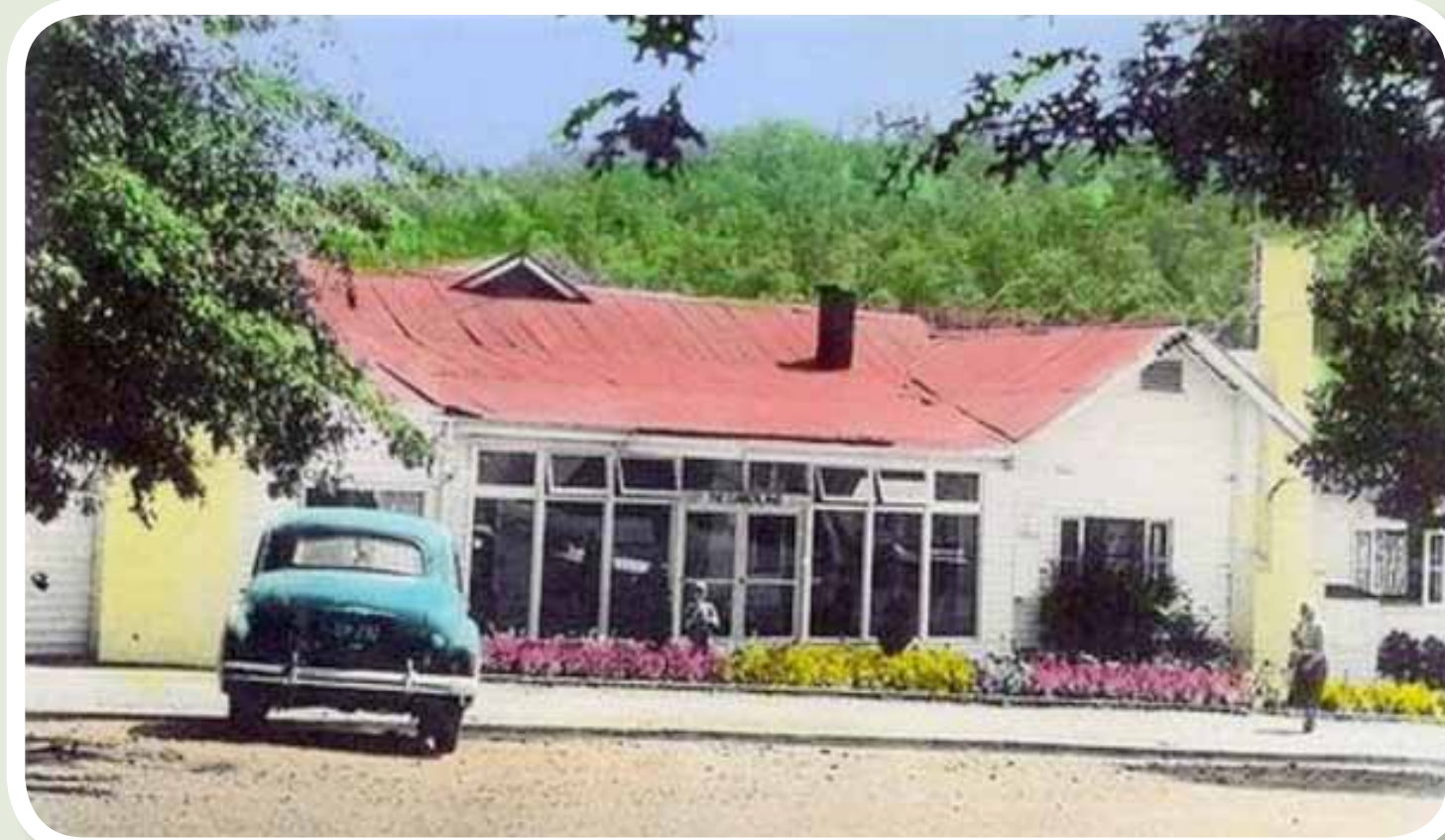
The Cumberland, c. 1950s [Credit line to be determined]