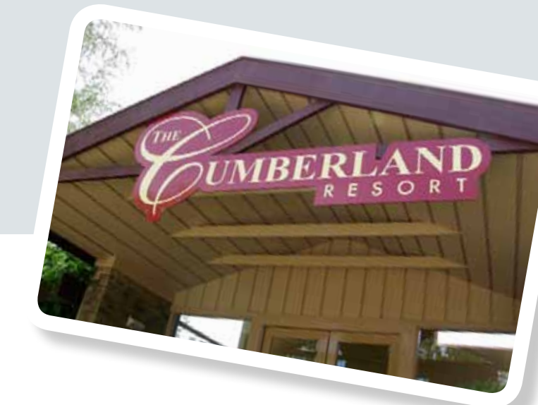
The Cumberland Resort, 2007 [Credit line to be determined]

A guesthouse called the Bungalow was built on this land for Emily Ada Barton in around 1917. Emily had been a guesthouse proprietress since at least 1915, when she managed the short-lived 'Chestnuts'. She was certainly well qualified for the job, having raised, cooked and cleaned for a grand total of 16 Barton children! Emily managed the Bungalow until she sold it to WC Walker in September 1923.